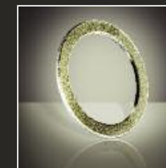
Thermiculite® 845 Flexpro™ (kammprofile) Facing

High temperature filler material for spiral wound gaskets. Wide range of metals available.