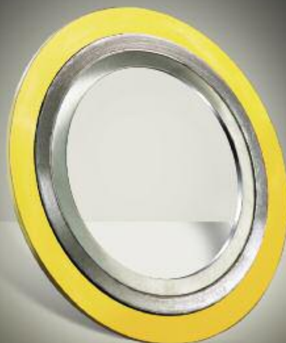
Thermiculite® 835 Spiral Wound Filler