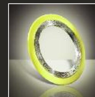
Thermiculite® 835 Spiral Wound Filler

High temperature sheet reinforced with a 0.004" 316L stainless steel tanged core. Available in thicknesses of 1/32", 1/16", and 1/8" in meter by meter (standard) and 60" x 60" sheet. Cut gaskets also available in all shapes and sizes.