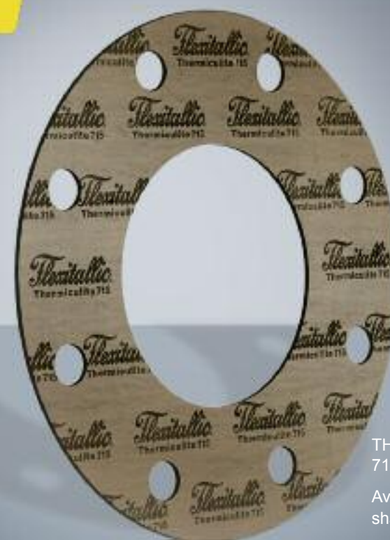
Thermiculite® 715 Cut Gasket