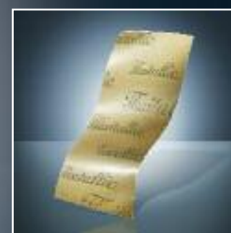
Thermiculite® 715 Coreless Sheet

High-performance coreless sheet material. Replacement of compressed fiber sheet line, SF 2401, 2420, 3300, 5000 and tanged graphite sheet. Available in thicknesses of 1/32", 1/16", and 1/8" in cut gaskets and 60" x 60" sheet.