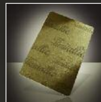
Thermiculite® 815 Tanged Sheet

High temperature sheet reinforced with a 0.004" 316L stainless steel tanged core. Available in thicknesses of 1/32", 1/16", and 1/8" in meter by meter (standard) and 60" x 60" sheet. Cut gaskets also available in all shapes and sizes.